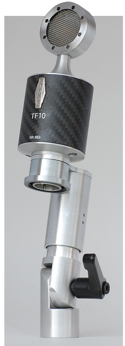
The TF10, with optional carbon finish, in Samar's newly designed shockmount.

I also think the TF10 represents very good value for money, given that almost every part of the mic is handmade by Samar, and that build quality, attention